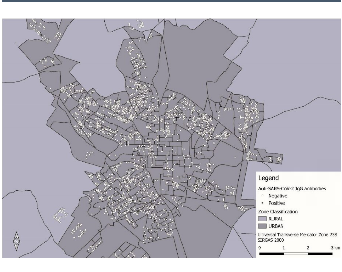
FIGURE 1 – Thematic Map of the Distribution of Participants in the "Test to Care" Study of the Municipality of São Carlos, São Paulo, Brazil, 2020

Between June and July, 2020, a total of 3937 individuals attended the testing units, 16 did not meet the inclusion criteria for the study (one declined to consent, two were under 18 years of age, and 13 were not living for at least 14 days in São Carlos). Thus, 3,921 individuals took part of the study, which corresponds to about a 70% participation rate (17) The Figure 1 shows the thematic map of the distribution of participants in the municipality of São Carlos.